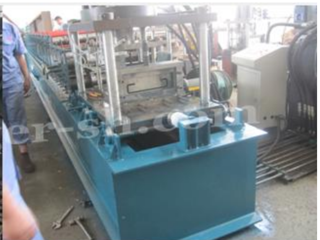
Front Right View