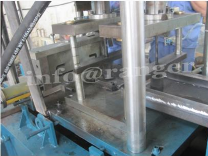
Punching and Cutting