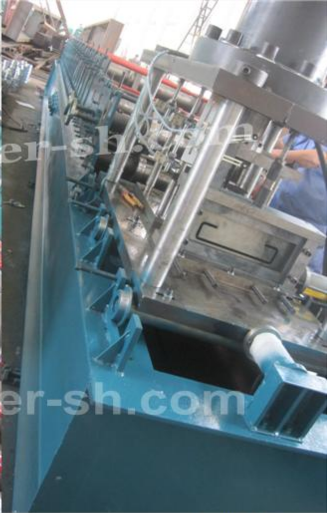
Front Left View