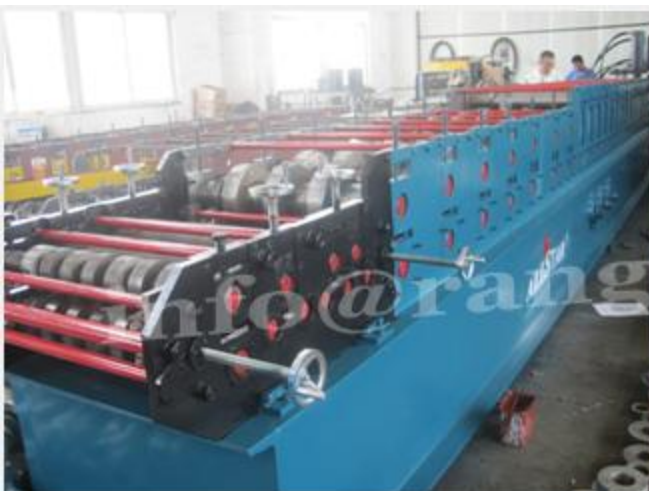
Back Right View