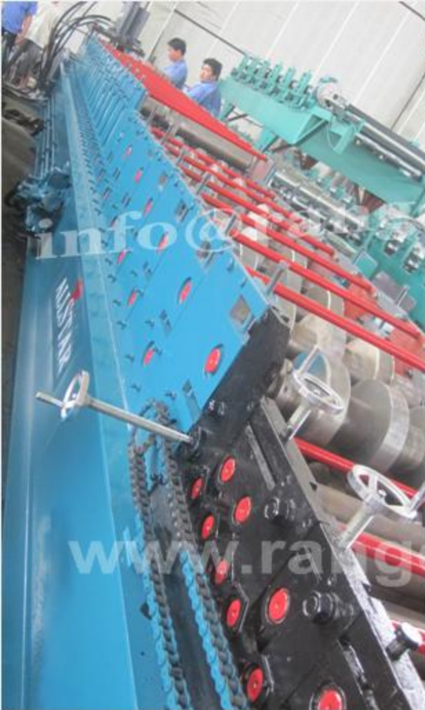
Back Left View