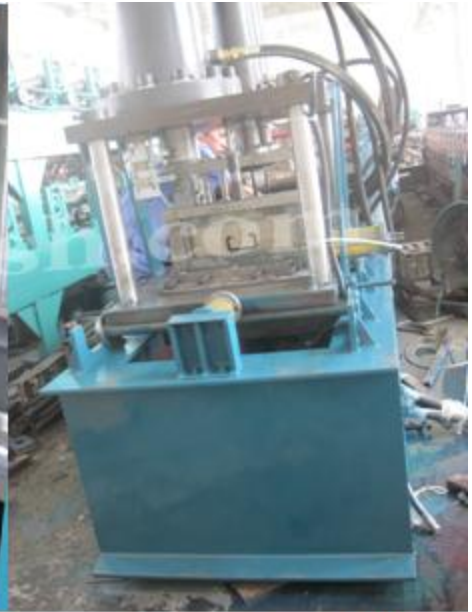
Different Cutting Mould